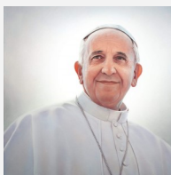
Pope Francis April 26, 2021

Let's not wait for our neighbors to be good before we are good to them, for others to respect us before we serve them. Let's begin with ourselves.